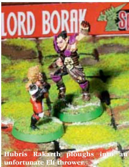
Hubris Rakarth ploughs into an unfortunate Elf thrower.

Are the Cowboys still potential Blood Bowl Champions? They won the last Blood Bowl in 2488, and this squad compares favourably. If they have a weakness, it is that unfortunate losses have caused them to bring some rookies in (remember the sad end to Nathan Greyfire's days as a Catcher when he was squished by the Mjolnir brothers' Double Whammy tackle?). Their Linemen look short of staying power, and Curfew may not have the time to weigh up the throw that Kool once had.