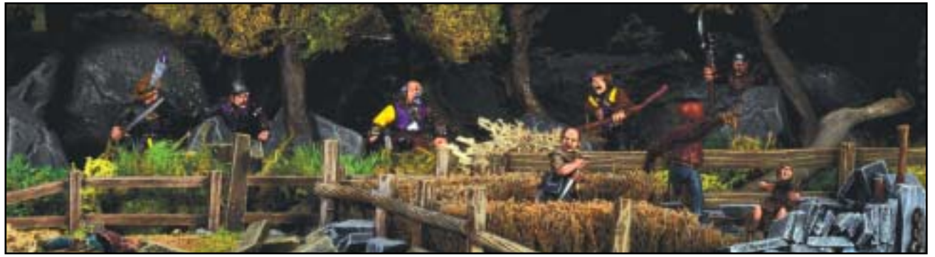
An Ostermark Warband sneaks up on an unsuspecting farmer

Fire: The warbands are merciless and ready to raze the farm to the ground once they have taken all that is of any worth. Every member of each player's warband starts the game carrying a torch which may be lit and thrown into a building once it has been looted. The rules for torches are given in the Empire in Flames rulebook (p.16) but are summarised below for your convenience. A torch acts as a lantern (if any Hero also possesses a lantern this may be used to burn a building down in the same way), any model equipped with one causes fear in all animals. As a weapon it is treated as a club but with a -1 To Hit modifier and any wounds caused by it cannot be regenerated by any model with the Regeneration special rules. The torch will only last for one battle. A model may torch a building at any time. If they are inside a building (setting fire to furniture and other belongings) then the fire starts automatically. They may also throw the torch up to 6" away to light a building and the fire will start on a roll of 2+ on a D6 (a 1 indicating it has bounced off a roof or merely sputtered out). Once a building is lit, roll a D6 at the start of each player's turn (not including any farmers who might be on the board) to discover if the fire is spreading. Add +1 to the dice roll for each turn the fire has been burning.