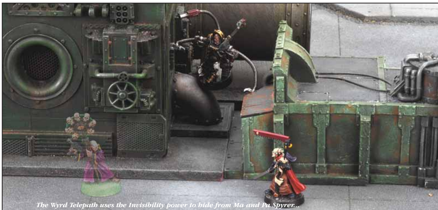
The Wyrd Telepath uses the Invisibility power to hide from Ma and Pa Spyre...

Wyrd that can hide their powers are fairly safe in the hive proper, although there is always a small risk of discovery. Sometimes as a Wyrd grows older and more confident in their abilities they will start to flaunt their superhuman abilities. Few Wyrd truly appreciate the danger they are in when they reveal their powers in this way and many are either burnt as a witch or warlock, or captured by the Scholastica Psykana because they over-estimate their own abilities. For this reason many Wyrd choose to live in the Underhive, where, for the most part, mutants are tolerated so long as they are not grossly mutated or afflicted with a dangerous power. Those Wyrd whose powers become impossible to hide have no choice but to escape to the Underhive or face almost certain death or capture.