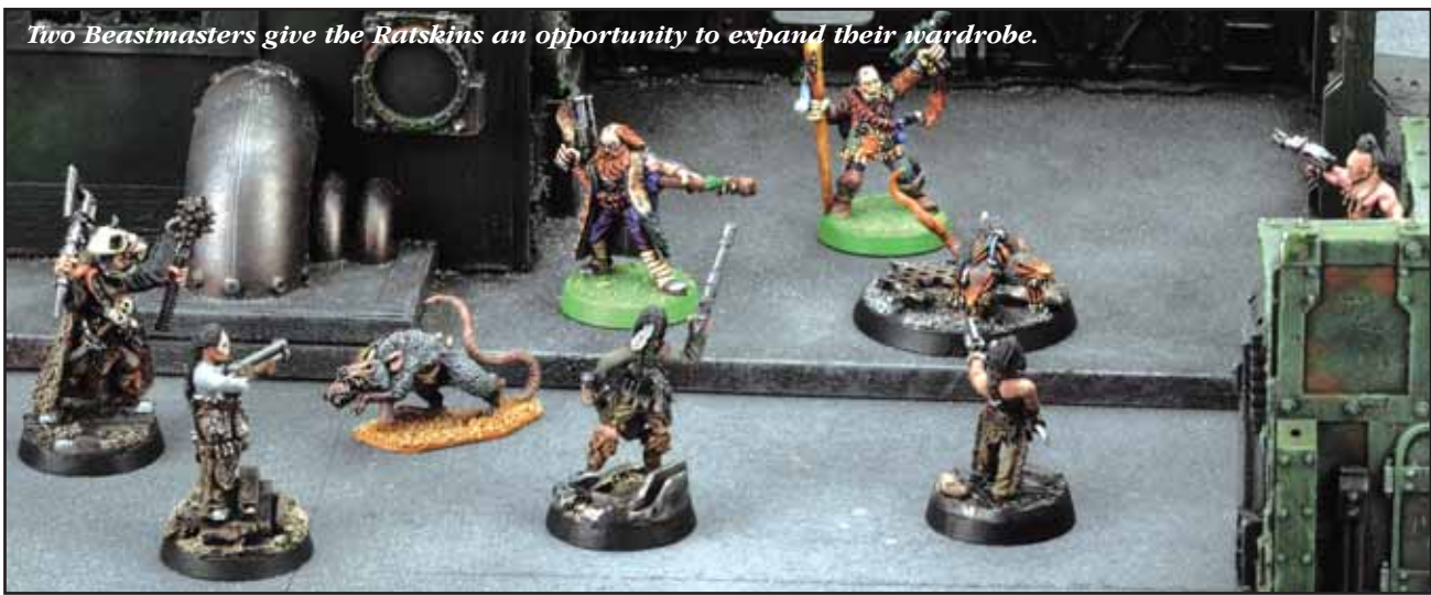
Two Beastmasters give the Ratskins an opportunity to expand their wardrobe.