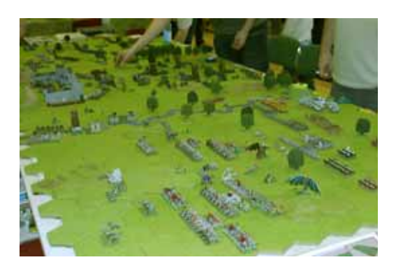
The Undead horde advances remorselessly.

still got the unit in with another attempt. In return, with 9 Liche priests the Undead `Doom and Despair' figured a lot against my knights. The second moral is that in Warmaster little is certain. You can reduce the odds but light cavalry (and flyers) attacking the flank of knights or shooty mediums does sometimes lose."