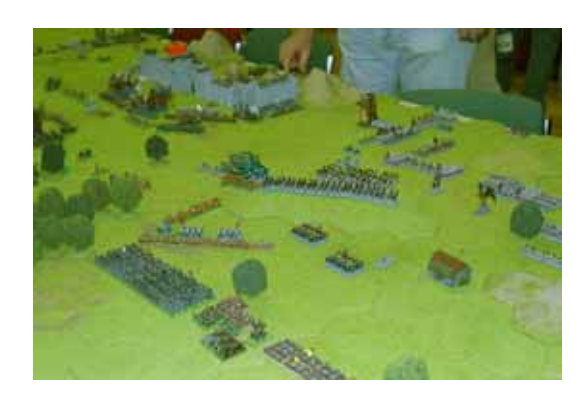
The Trollslayers and Dark Elves clash