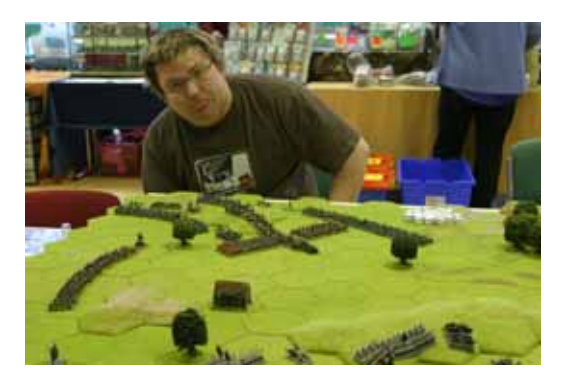
Damunblasts Dwarves pack up and go home

John; "The whole thing is horrible to watch, at least from the vantage of the retreating Bretonnians"