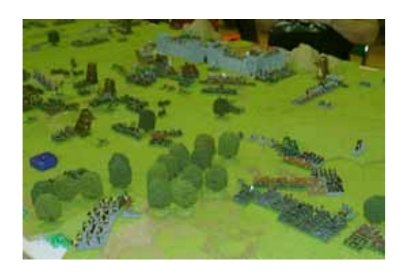
The Trollslayers are driven back and slayed