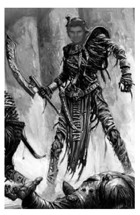
The formidable Tutandrott `persuades' another recruit to join his army!

His 5000-point army consisted of the following;