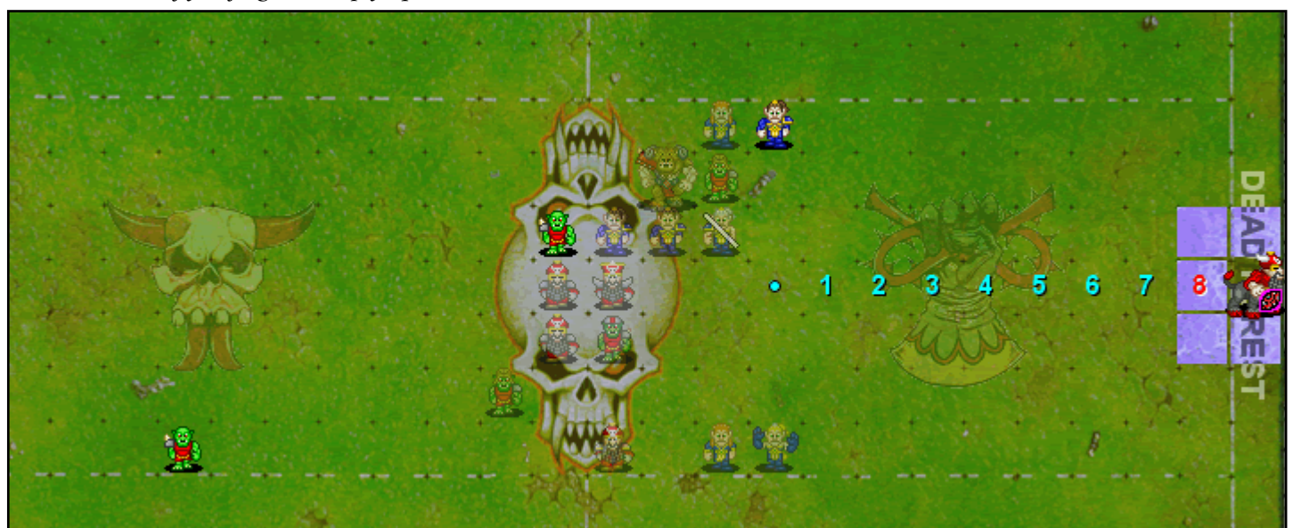
At this point, the Bull Centaur is only 9 squares from the endzone and can just squeeze over the line, if at all possible knock down the last block on the Frenzy so that the Bull doesn't need to dodge away! It is quite a risky manoeuvre, but in the last turn of the match, tied at 1-1 what else have you to lose?