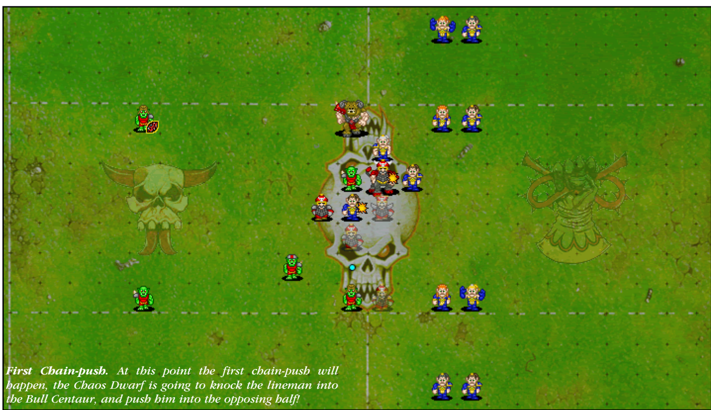
Another chain-push will now occur, with the aim of pushing the Bull further into the opponents half, but first one of the squares needs to be filled up before the chain-push can happen! Always be careful of this when attempting any chain-pushes, your well laid out plan could be ruined if you forget an empty square!