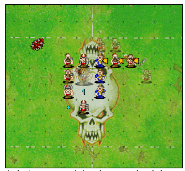
The minotaur now uses his Frenzy and strength to push the catcher a further 2 squares towards the endzone, notice how the linemen we moved last time were important to this action. You could always use a Norse Blitzer here as well, as they have Frenzy, and plenty of assists are present, and he is a lot more reliable than a Minotaur!At this stage the Thrower and Catcher are free, and if you like, you can throw the pass, hopefully the ball hasn't gone too deep for this!