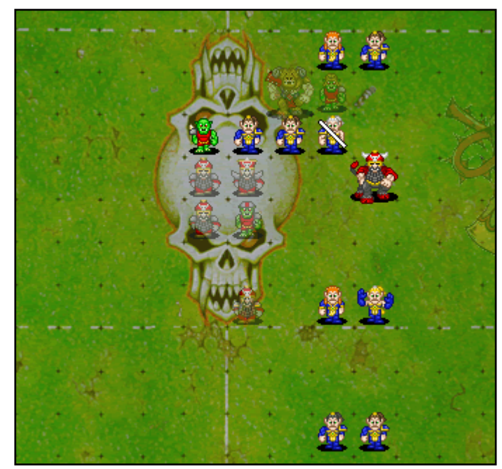
Another chain-push will now occur, with the aim of pushing the Bull further into the opponents half, but first one of the squares needs to be filled up before the chain-push can happen! Always be careful of this when attempting any chain-pushes, your well laid out plan could be ruined if you forget an empty square!